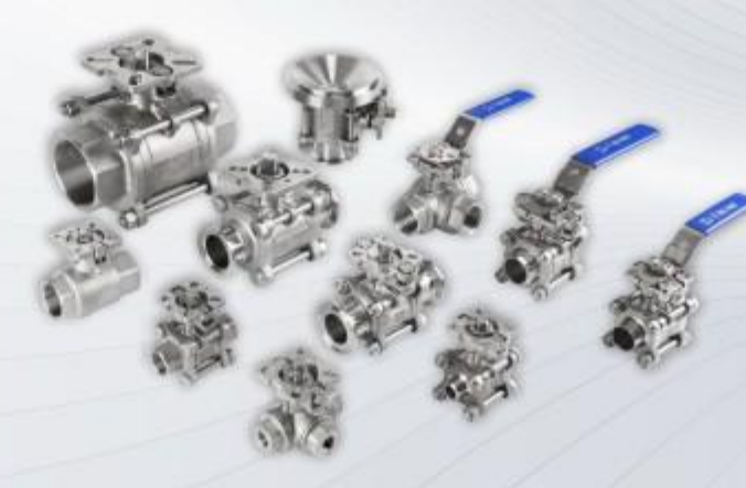
INDUSTRIAL GRADE HIGH PLATFORM BALL VALVE 工业级高平台球阀系列