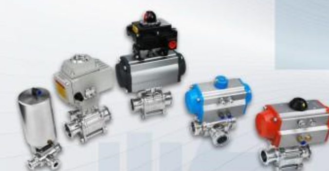
SANITARY GRADE GAS /ELECTRIC BALL VALVE 卫生级气/电动球阀系列