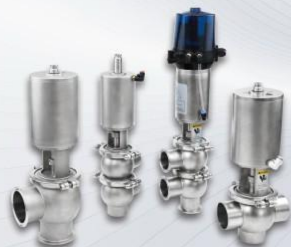
SANITARY VALVE SERIES 卫生级阀门系列