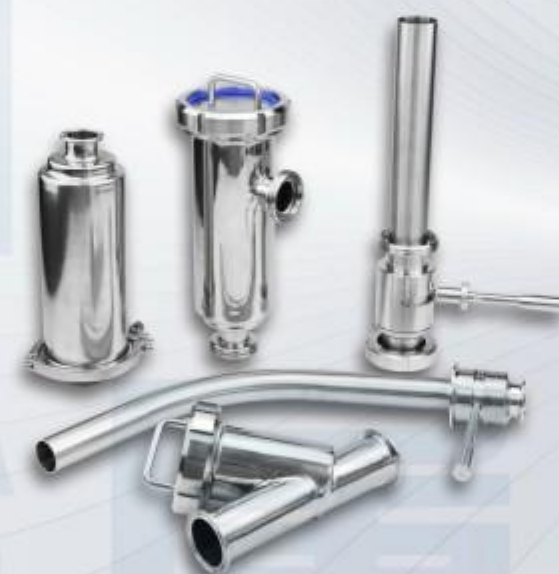
SANITARY GRADE FILTER SERIES 卫生级过滤器系列