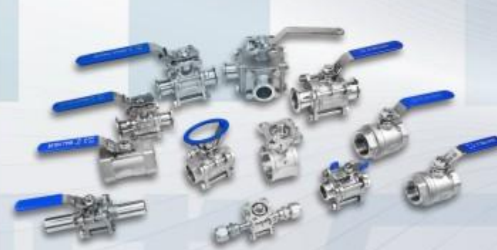
INDUSTRIAL GRADE BALL VALVE SERIES 工业级球阀系列