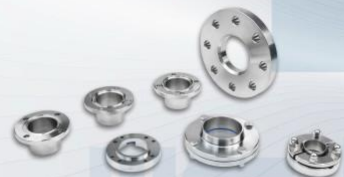
ASEPTIC SERIES CONNECTORS 无菌系列连接件