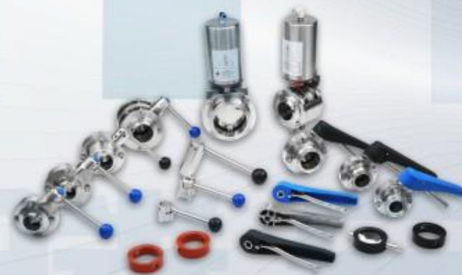
SANITARY BUTTERFLY VALVE SERIES 卫生级蝶阀系列