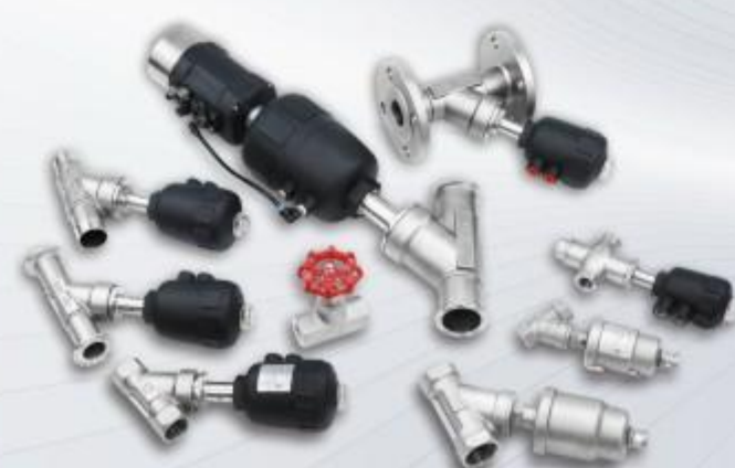
ANGLE VALVE SERIES 角座阀系列