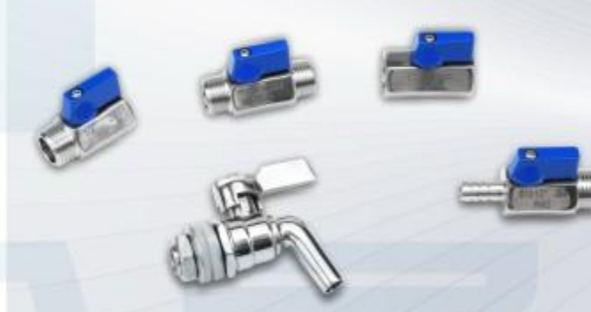
MINI BALL VALVE SERIES 迷你球阀系列